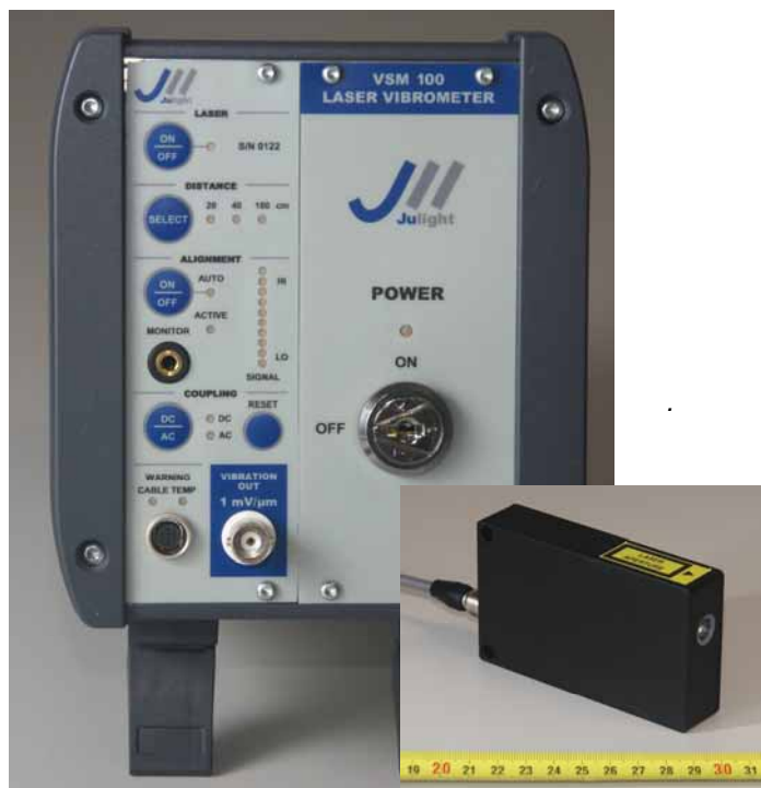
Left: VSM 100 Laser Vibrometer main unit Right: Standard optical head, with Speckle-Tracking functionality

The laser beam shall be aimed at the target surface, and the vibration signal is readily available from the output BNC connector. Automatic Speckle-Tracking functionality allows unattended operation on any diffusive surface, while an LED-bar indicator measures optical signal strength in real-time. The vibration signal can be displayed onto an oscilloscope, or supplied to a FFT analyzer for frequency domain analysis.